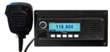
TR-910 Offshore Radio

TR-910 Offshore Radio includes a standard DIN-flange for console mounting. Custom made flanges are available on request. The radio integrates easily with all Jotron Ricochet recorder systems including SmartOil. TR-910 Subrack Radio is available for installation into existing 19 inch equipment racks or control room consoles. The radio is approved according to ETSI, FCC and marine standard for offshore.