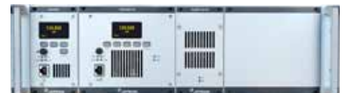
TR-7750 VHF radio

TR-910 Multipurpose VHF Airband Radio is a lightweight, robust and portable multiTR-910 Multipurpose VHF Airband Radio is a lightweight, robust and portable multipurpose transceiver based on the same platform as the TR-7750. This versatile radio can be set in a desktop or carried in a bag. It can be used as a last resort radio or even as the main radio in e.g. helidecks and other areas where portability is a key factor.