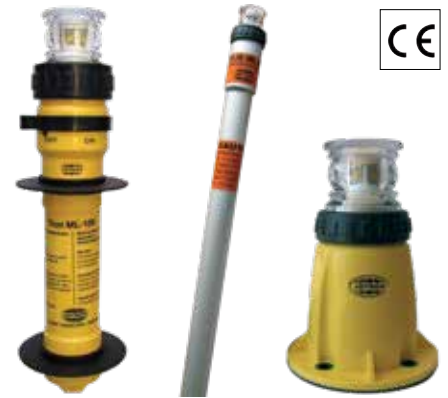
Tron ML-100 Tron ML-200 Tron ML-300